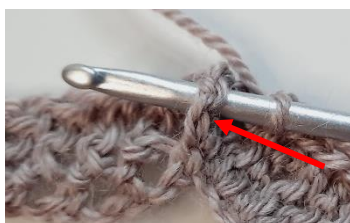
Insert hook under the post

FPSC - Insert hook from front to back to front around the post of the next stitch - under the post of the ST below . Yarn over - YO, pull up a loop (2 loops on hook). Yarn over (YO) and pull through both loops.